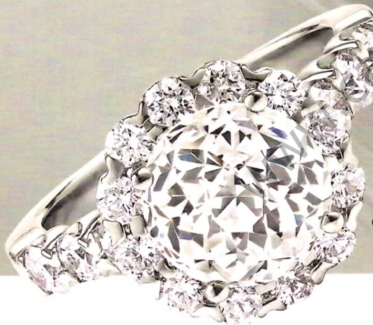
CROWN BRILLIANT® COLLECTION